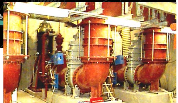
Three Flomatic 30" (750mm) Model 90CS Cushioned Swing Check Valves installed with three 200HP Pumps. Total pump capacity: 38,800 GPM (2,445 Liter per second) pumped into a 42" (1050mm) forced main.

BOSTON Massachusetts The "BIG DIG" Project Pumping Station with three Flomatic 30" and two 20" Model 90CS Cushioned Swing Check Valves.