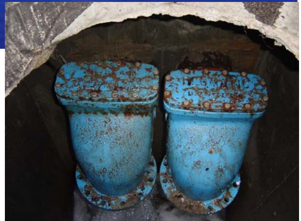
Photo above shows a typical installation of two 10" (250mm) Model 78A angled flapper swing check valves installed in New York City. Valves are piped to the discharge of submersible pumps used for the NYC subway systems. NYC has the largest subway system in the world, with over 650 miles of track below ground.